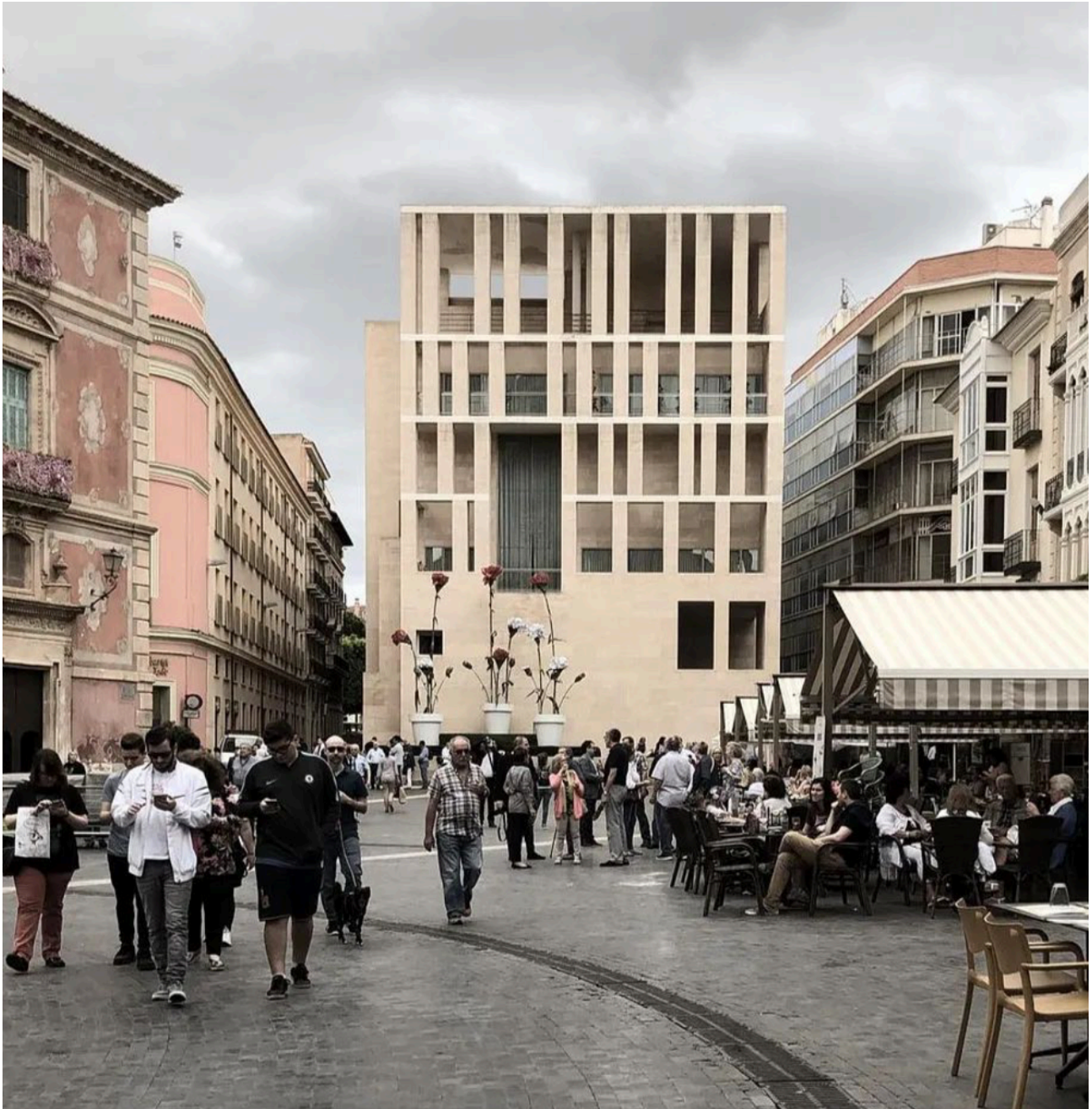
DASU Honours programme _ december 2023